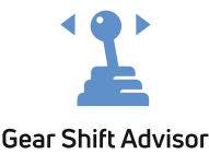
Gear Shift Advisor